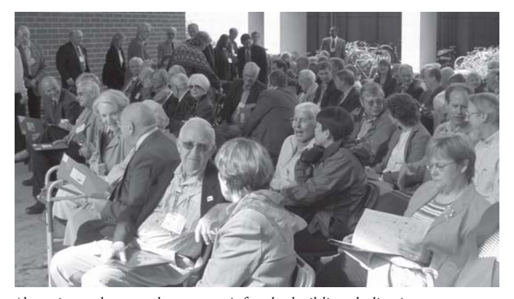
Alumni, speakers, and guests wait for the building dedication ceremony to begin.