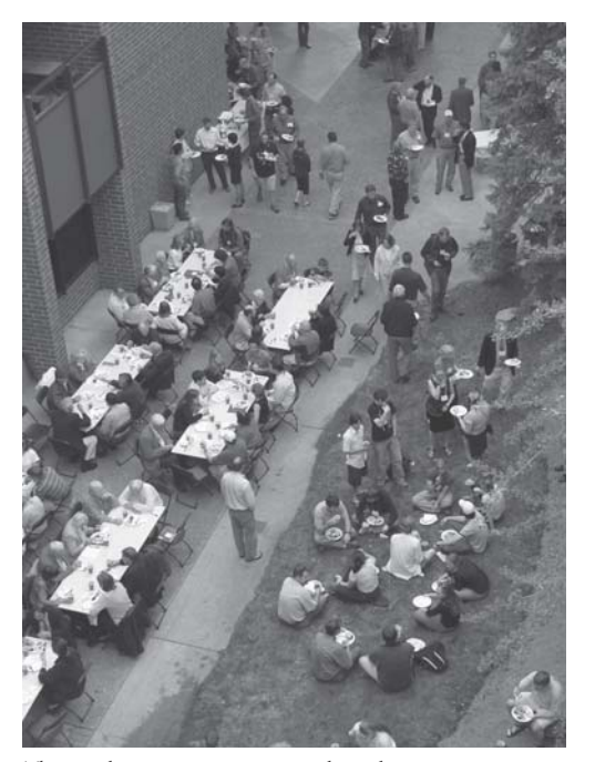
The Friday evening courtyard cookout.